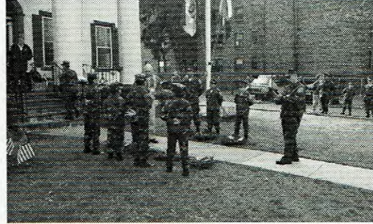
Wreaths Across America ceremony at White Plains American Legion Hall marks 50 years for Vietnam vets.