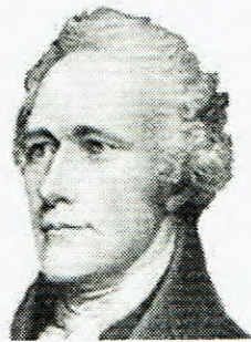
Alexander Hamilton Visionary Founding Father.