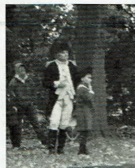
General George Washington surveyed the battle site.