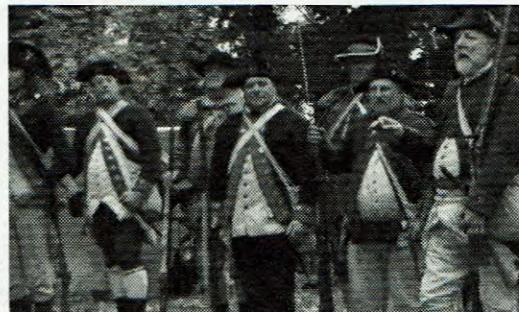
Continental soldiers formed ranks for the battle and demonstrated musketry.

White Plains Historical Society hosted the 239 th Anniversary Commemoration of The Battle of White Plains on Sunday, October 25, 2015 at Jacob Purdy House National Historic Site (Washington's Headquarters in 1776). The ceremony featured flag raising, roll of honor, soldiers' campsite, and live harpsichord music and refreshments. All free to the public.