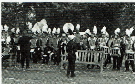
White Plains High School Marching Band played at the Commemoration Ceremony.

White Plains Historical Society hosted the 239 th Anniversary Commemoration of The Battle of White Plains on Sunday, October 25, 2015 at Jacob Purdy House National Historic Site (Washington's Headquarters in 1776). The ceremony featured flag raising, roll of honor, soldiers' campsite, and live harpsichord music and refreshments. All free to the public.