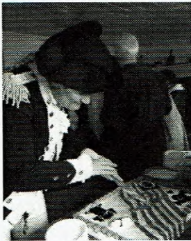
General Washington shared his birthday cake with guests.